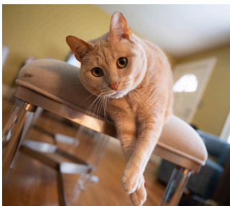
Bubbles - February's Pet of the Month