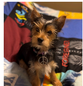
Barclay - May's Pet of the Month