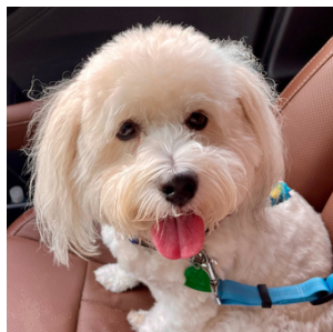
Bentley - March's Pet of the Month